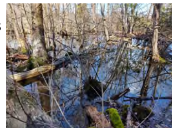
Chiesa Farm wetlands