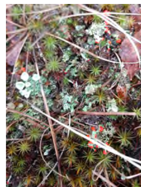
Pixie cups and British soldier lichens