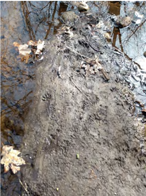
Raccoon tracks in the mud along the stream in Dunback Meadow (March)