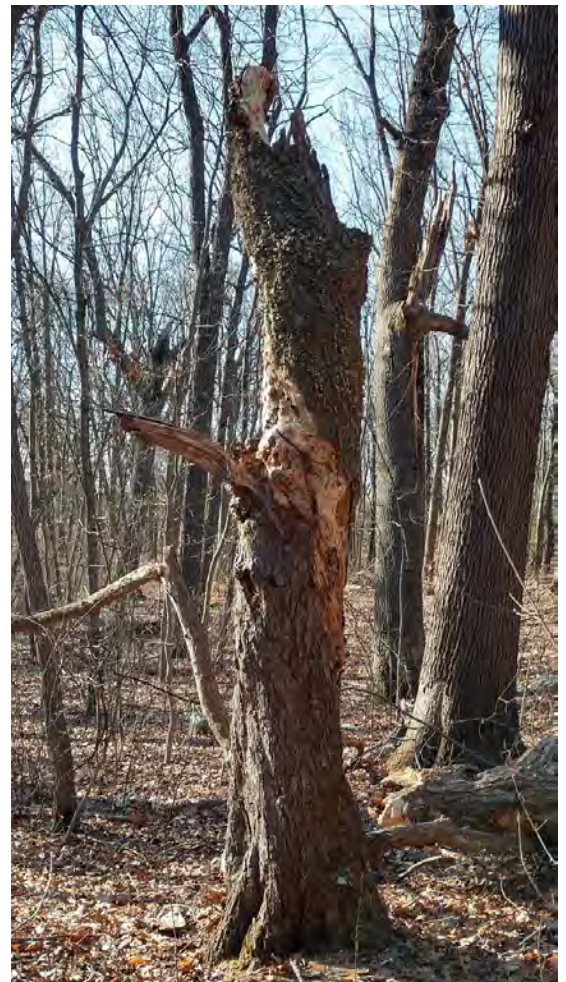
Interesting snag with lichens on it in the Sutherland conservation lands (March)